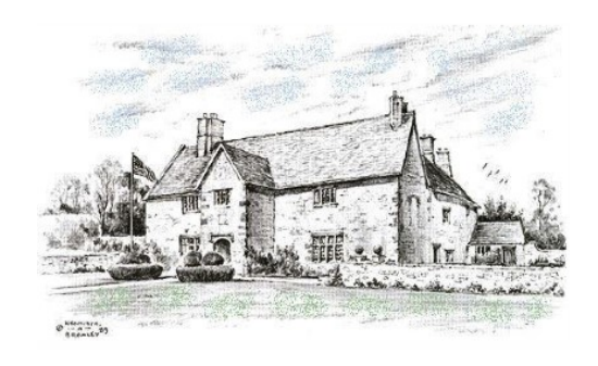
Friends of Sulgrave Manor