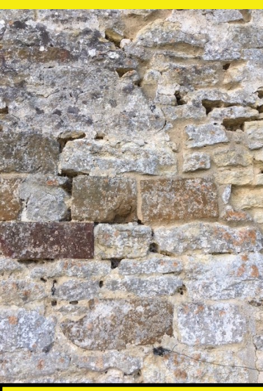
Holes from masonry Bees in the Manor's walls.