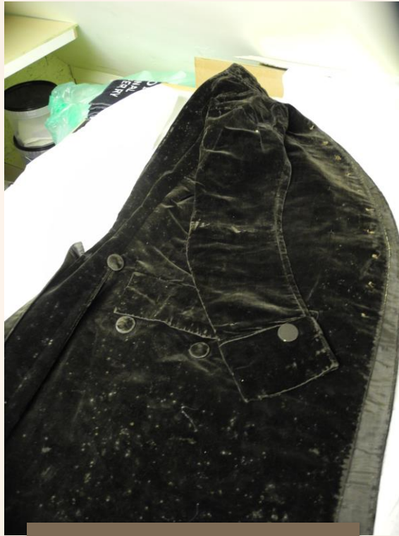
George Washington Jacket