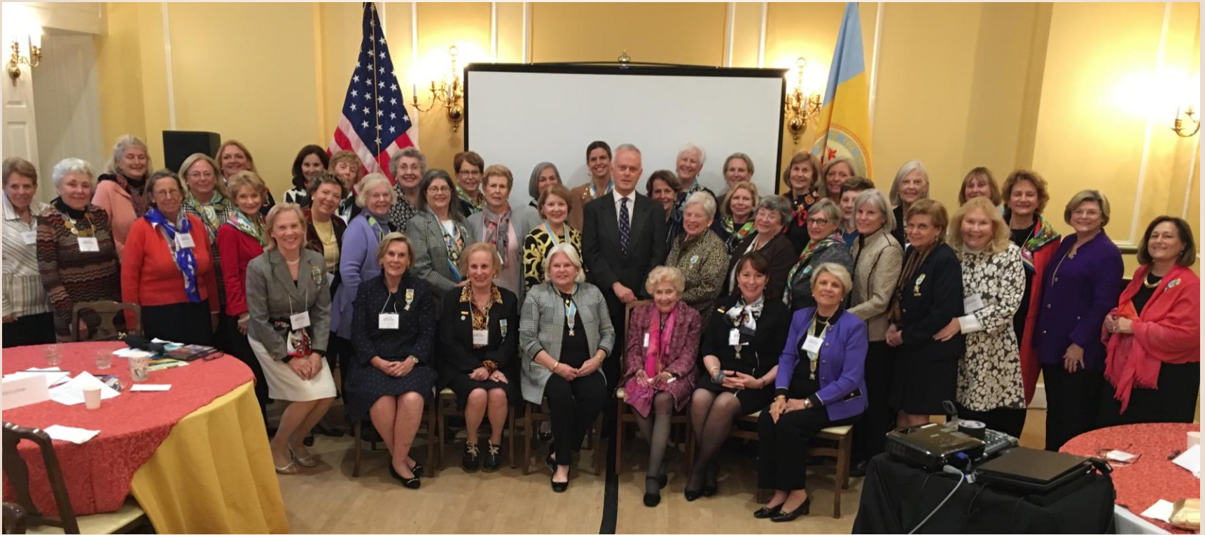
2019 Friends of Sulgrave Manor Annual Meeting