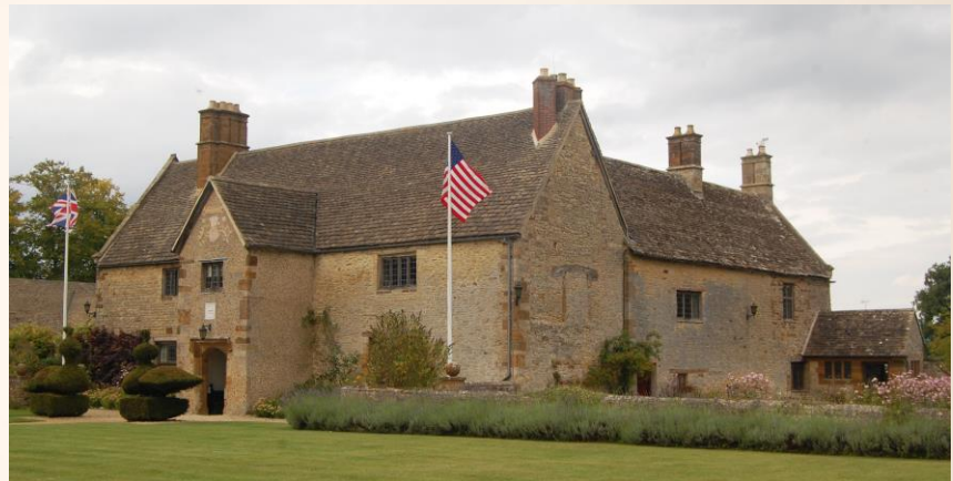
2021 Friends of Sulgrave Manor trip to Great Britain which will celebrate the Centenary of the Manor's opening