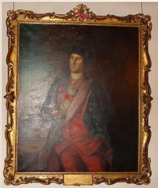
George Washington Painting