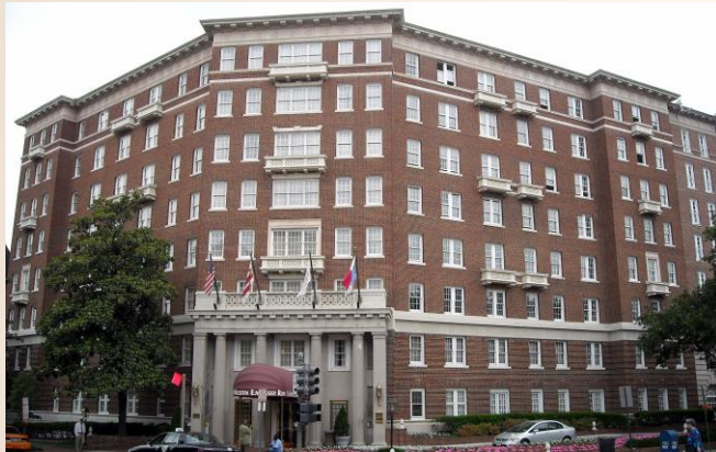
2019 Friends of Sulgrave Manor meeting in Washington, DC