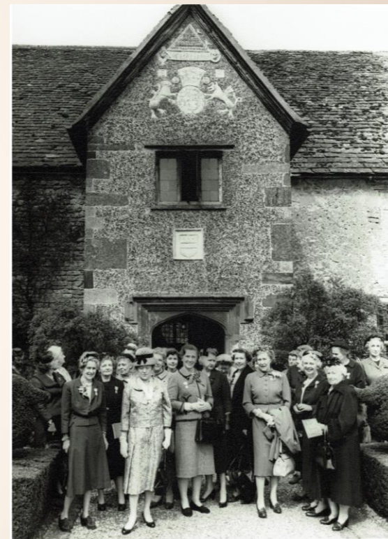
1961 NSCDA Trip