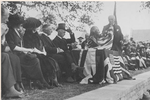
21st June 1921. Official opening of Sulgrave Manor. Unveiling of the bust of George Washington