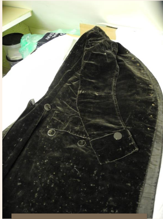
George Washington Jacket