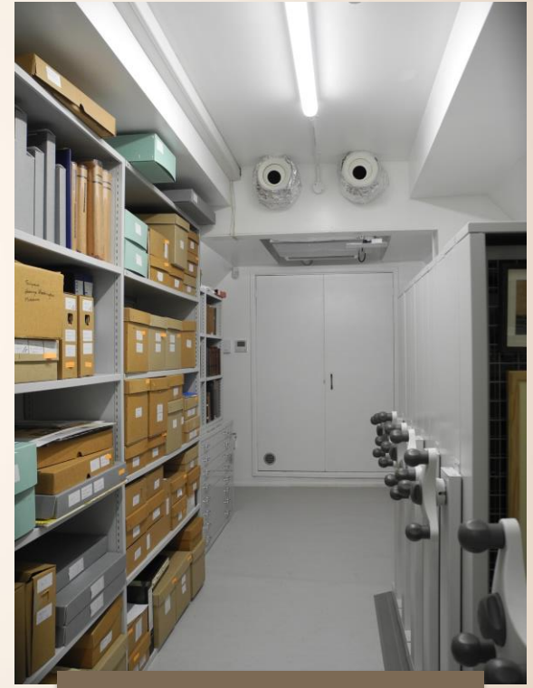
New Archive Room