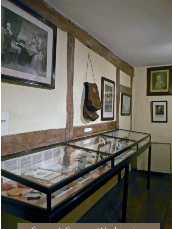
Current George Washington Exhibit