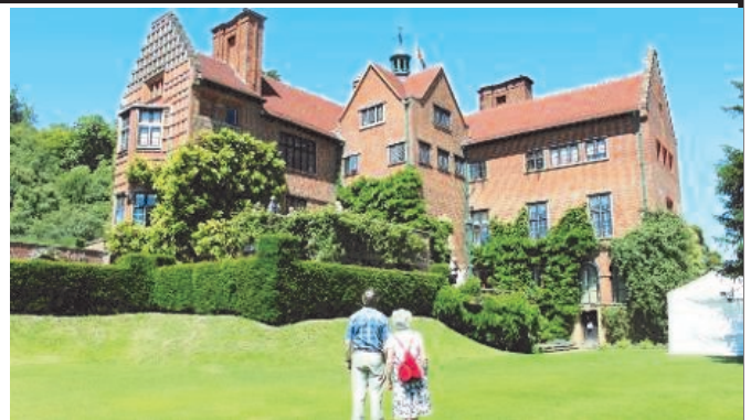
Spend June 3, 2016 at Chartwell, the principal residence of Sir Winston and Clementine Churchill in Kent, England