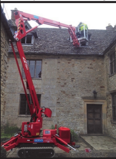
The last window being reinstalled after a year of repairs.

My great thanks to all of you who contributed towards the $100,000 raised to make this enormous project possible. This is my last newsletter as I go out of office in October.