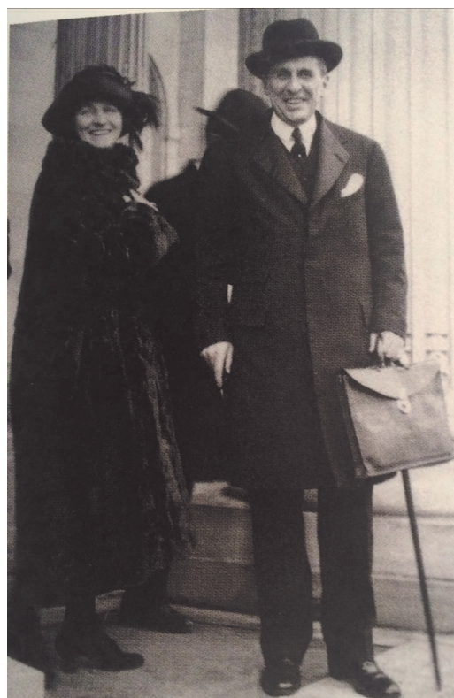
Viscount and Viscountess Lee of Fareham

The Lees took a long lease of Chequers, a country house and 1,000 acre estate in Buckinghamshire in 1909. After the owner died in 1912 Faith Moore and Ruth Moore Lee purchased the property, and the Lees began restoration under the supervision of the architect Sir Reginald Blomfield. In 1917 they gave the estate and the entire contents of the house which included a library, historical papers and manuscripts as well as a collection of Cromwellian portraits and artefacts, in trust to the nation. The purpose of this gift, which included an endowment of £100,000 for its upkeep, was to provide an official residence and retreat for British Prime Ministers. In 1918 Lee was elevated to the peerage as Baron Lee of Fareham, of Chequers in the County of Buck-