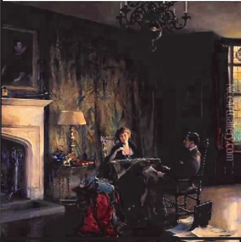
The Last Days at Chequers Lord and Lady Lee of Fareham at the Time of Their Leaving Chequers New Year 1921, by Philip Alexius De Laszlo

Manor that his “first sight of Sulgrave” was at the invitation of Lady Lee who invited him to accompany her to the manor to discuss the furnishings in 1920. Sir Reginald Blomfield, who had headed the restoration at Chequers, became the architect who rebuilt the west wing of the manor and designed the plans for the garden at Sulgrave Manor. In 1923 Lady Lee donated an embroidery to Sulgrave