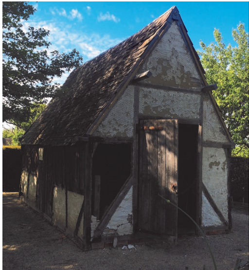
The Forge is a great teaching tool for the schools teams, and is much in need of repairs—starting with the roof. The Trustees have agreed that the current roof must be replaced with wooden shingles.