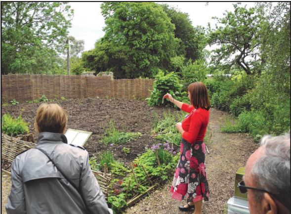
The gardener, explaining what a wonderful teaching tool the herb gardens is. It was doubled in size thanks to our donations.