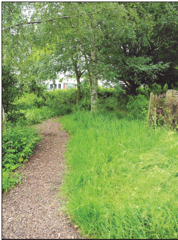
The school children love to go off running down the path to the Lady Garden.