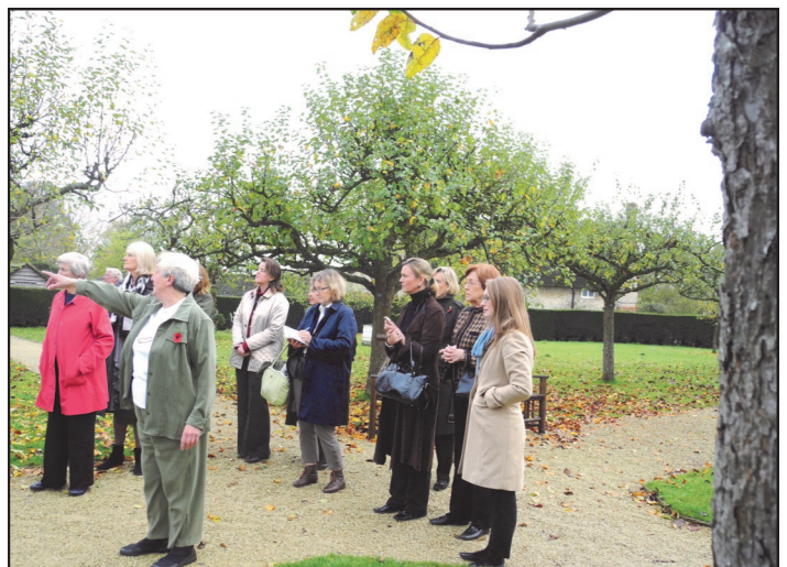
The London Dames on a tour of Sulgrave Manor. Note the beautiful apple orchard in the background.