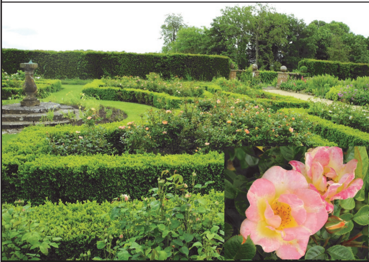
The formal rose garden at Sulgrave manor, with the "Millieum Sulgrave Rose".