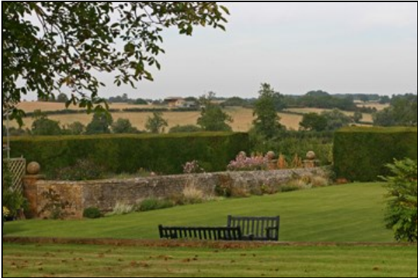
A view of the surrounding countryside.