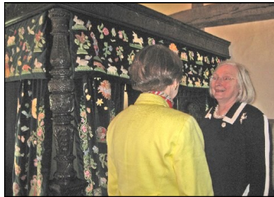
Old friends chatting in front of the beautifully embroidered bed hangings in the Great Chamber.

Manor as a Museum. That was followed by a traditional Pimms Cup and a buffet lunch with our English friends and members of the Board of Sulgrave Manor, led by Baroness Jill Knight of Col-