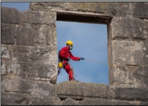
A scene you missed by not traveling with the Dames to Croatia. A modern Gladiator using "Roundup" instead of a sword.