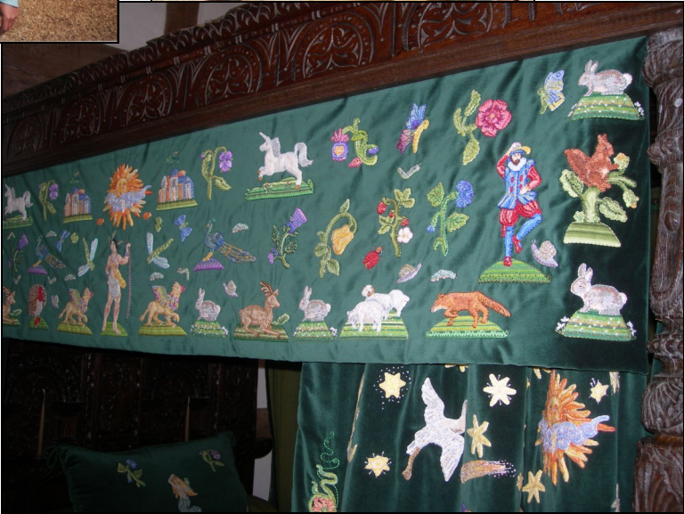
A close up of the Embroideries.