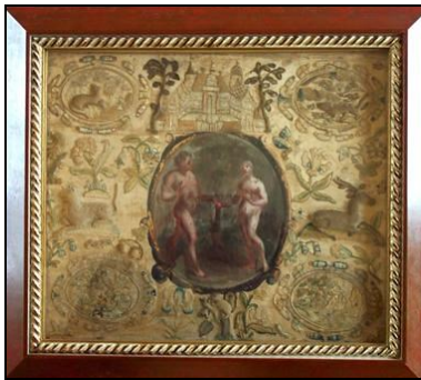
Mid-17th century embroidery, sewn by the great great grandmother of George Washington.

It remained in Virginia with the Washington family until the 20th century. The purchase in 1914 of Sulgrave Manor in South Northamptonshire to be "a centre from which sentiments of friendship and goodwill between the British and American peoples will forever radiate" predates by some twenty years Churchill's coining of the phrase "special relationship", encapsulating the recognition of the shared language, values, culture and bloodlines. The embroidery was given back to the Manor, built by the five times great grandfather of the first President of the independent United States George Washington, as part of the American contribution to setting Sulgrave Manor up in its