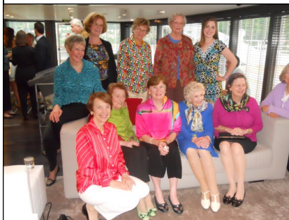
Dames gathering before dinner on board Le Boreal in the Adriatic.

What we call "globalization" the ready intermingling of formerly separate cultures, actually began in places like these, fostered by the Pax Romanun, the Roman rule that made traveling and trade safe and predictable. The seas were the highways and we were traveling one of them, modern voyagers on an ancient passage.