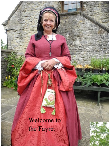
Welcome to the Fayre.