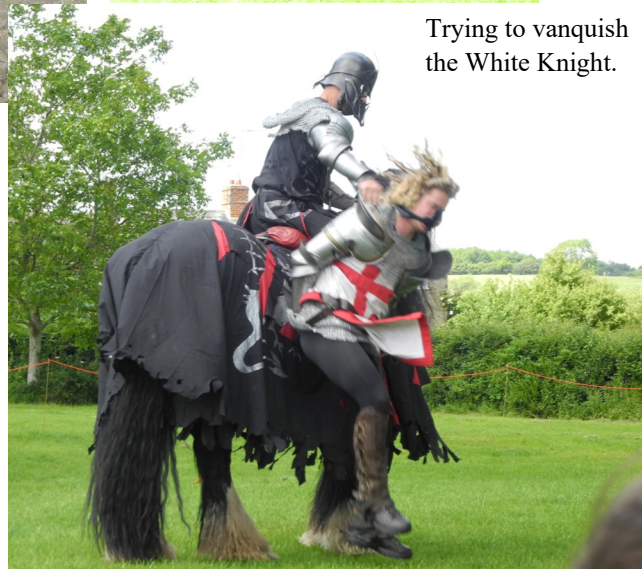
Some Events of the Day