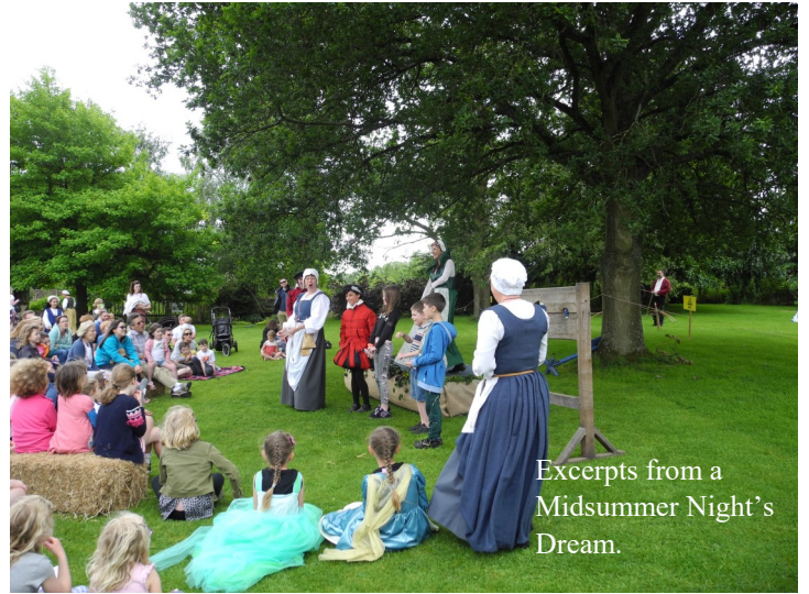
Excerpts from a Midsummer Night's Dream.