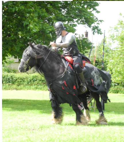
Trying to vanquish the White Knight.