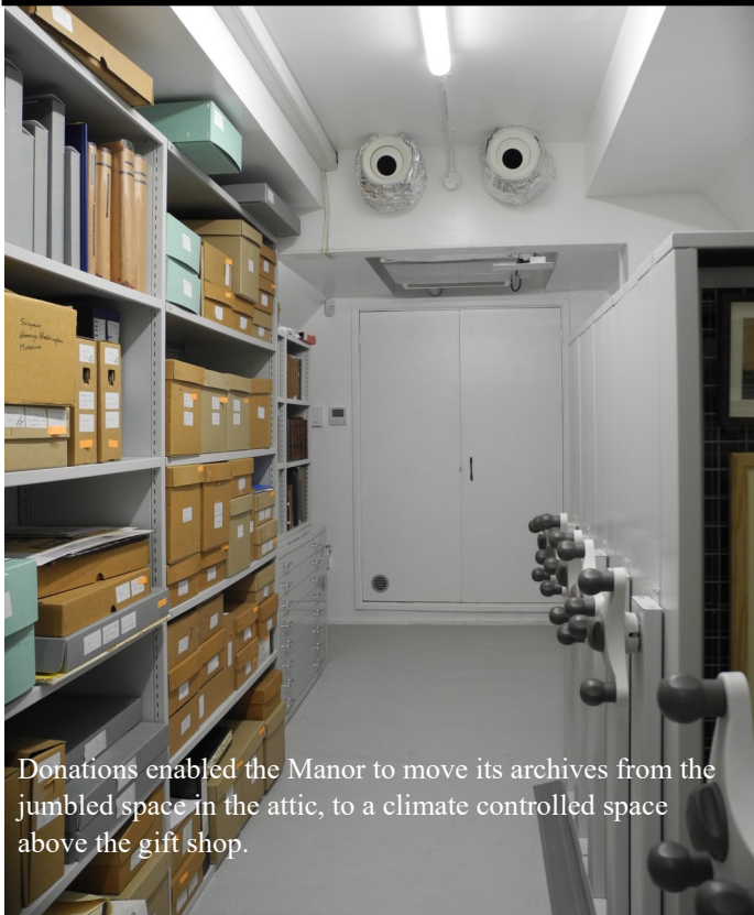
Donations enabled the Manor to move its archives from the jumbled space in the attic, to a climate controlled space above the gift shop.

1st course - Scottish egg salad with spinach and baby greens. French Bread 2nd course - Intermezzo